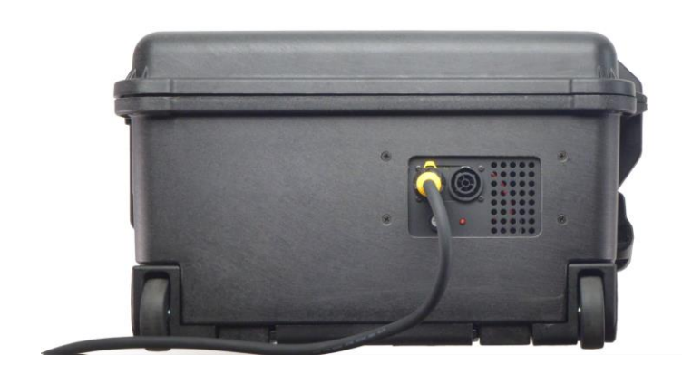
Figure 2: Face & Back Panel