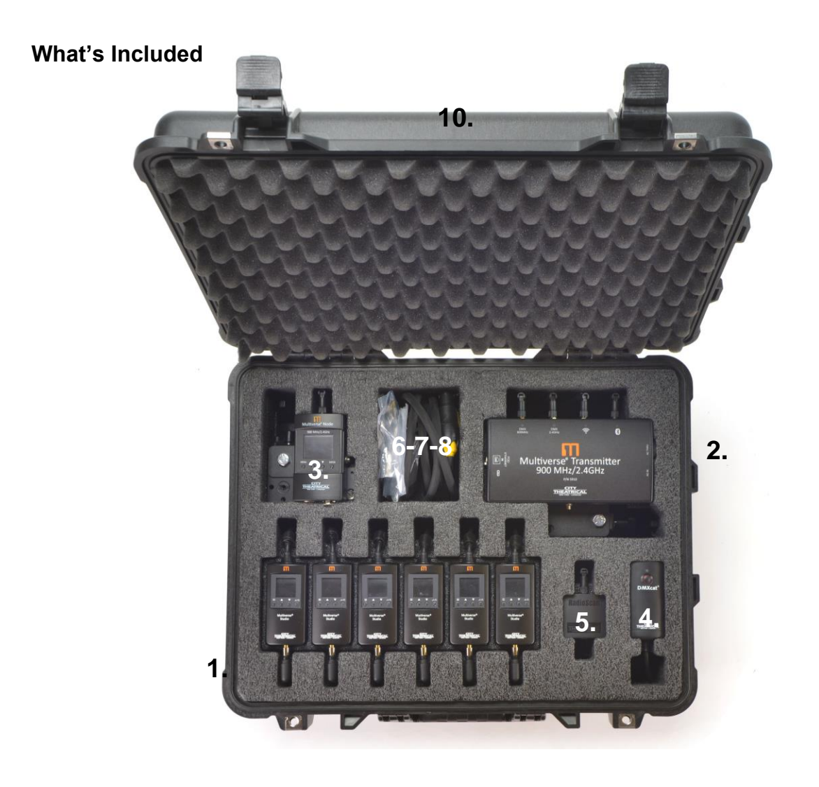
Figure 1: What's Included